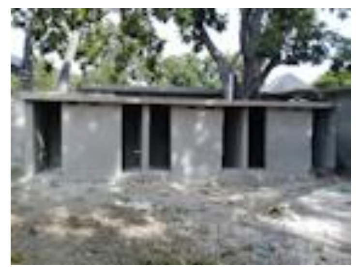
Left --The kitchen, storage room and bath is almost completed on the new land thanks to your donations!!

Right -- The bathrooms and showers are also coming along. We've already purchased tiolets, submergible water pump, new generator, solar power and a urinal. Great progress!!!