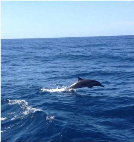
<Look what we saw on our snorkeling adventure!

This man walks about four> miles on the main road just to sell his pile of sticks to make a living. He has come to know me as his friend and allows me to give him a ride. I buy him food, a drink and give him some money. His clothes look like he's worn them all year. He did say he knows Jesus so I'm thankful one day he'll